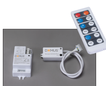
Internal ON/Off Sensor